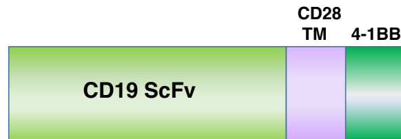
Figure 1. CAR-T cells expressing the above constructs are available from Promab targeting CD19 scFv antigen. ScFv, single chain variable fragment. These CAR-T cells are generated with CD19 scFv-4-1BB construct.

The CD19 protein is overexpressed in hematological cancers. CD19 scFv CAR-T cells can be used to target CD19 antigen.