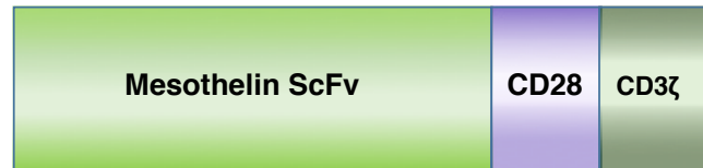
Figure 1. CAR-T cells expressing the above constructs are available from Promab targeting Mesothelin antigen. ScFv, single chain variable fragment. These CAR-T cells are generated with Mesothelin ScFv-CD28-CD3 \zeta CAR construct.

Mesothelin is a protein present on normal mesothelial cells and is overexpressed in several human tumors, including mesothelioma, ovarian and pancreatic adenocarcinoma. Mesothelin can be used as a tumor antigen for targeting by CAR-T immunotherapy.