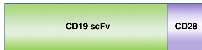
Figure 1. CAR-T cells expressing the above constructs are available from Promab targeting CD19 scFv antigen. ScFv, single chain variable fragment. These CAR-T cells are generated with CD19 scFv-CD28 construct.

The CD19 protein is overexpressed in hematological cancers. CD19 scFv CAR-T cells can be used to target CD19 antigen.