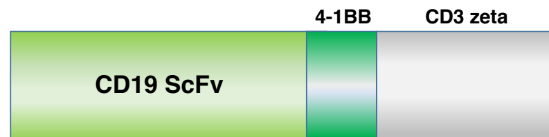
Figure 1. CAR-T cells expressing the above constructs are available from Promab targeting CD19 scFv antigen. ScFv, single chain variable fragment. These CAR-T cells are generated with CD19 scFv-4-1BB-CD3ζ construct.

The CD19 protein is overexpressed in hematological cancers. CD19 scFv CAR-T cells can be used to target CD19 antigen.